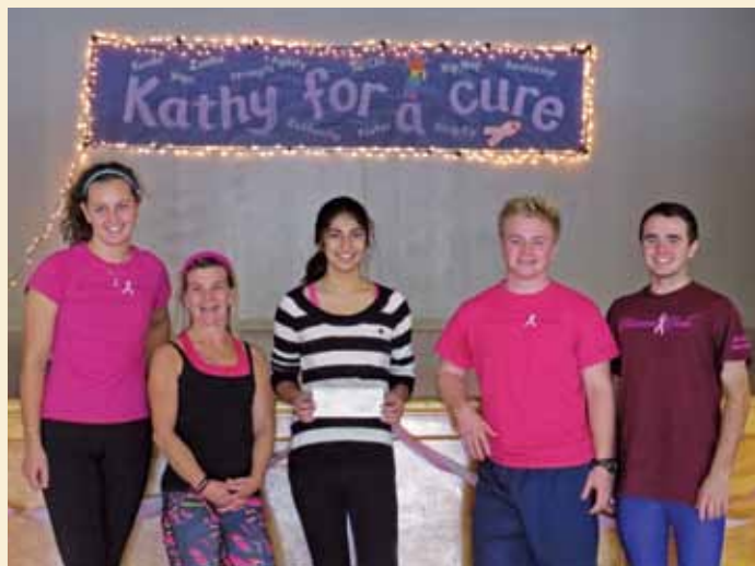
Oyster River National Honor Society students raised $1,000 for Kathy for a Cure, to benefit The Beyond the Rainbow Fund.