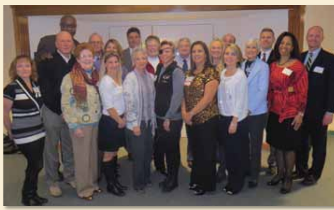
Members of Exeter Hospital's Major Gift Initiative Team, Community Advancement Partners and volunteers, proudly sharing their experiences of the care they received at the affiliated organizations of Exeter Health Resources while supporting the advancement of our mission.

To learn how you can help, please visit exeterhospital.com .