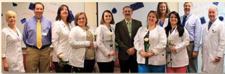
The first group of students that completed an eight week Medical Assistant (MA) class as part of a new partnership between Exeter Health Resources and Great Bay Community College, pictured here with staff members of Exeter Health Resources and affiliates.

The Center for Cancer Care at Exeter Hospital participates in several national research groups sponsored by the National Cancer Institute, which enables the Center to offer clinical trials to patients undergoing treatment at Exeter Hospital. These offerings allow patients to voluntarily take part in leading edge research that does not necessitate travel outside the Seacoast area. Exeter Hospital provided $152,911 for clinical trials and research which served 397 patients.