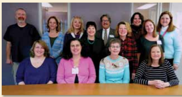
These nurses, social workers, spiritual care coordinator and grief counselor are just some of the caring staff members of Rockingham Visiting Nurse Association & Hospice who make a difference in their patients' lives every day.

These lists reflect donors whose gifts were received between October 1, 2014 and September 30, 2015.